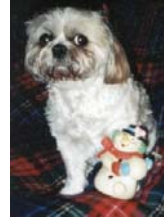
Al, Rita and Chelsea ☺

PowerSeller?: Yes Unique Positive Feedback comments as at November 2002: 6012 Total Positive Feedback comments as at November 2002: 6453